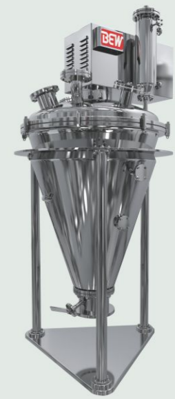
Cone Mixer-cum-Dryer (NAUTA TYPE)

BEW ® BEW Engineering Pvt. Ltd. (A group company of Bifriends Engineering Works)