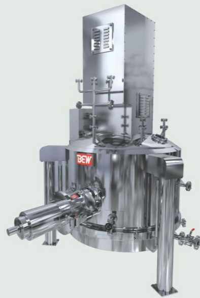
Agitated Pressure Nutsche Filter Dryer

Above and all, similar types of equipments are exported to countries like Saudi Arabia, Nigeria, Thailand, Turkey, Indonesia, Malaysia, Germany, Brazil, China etc..