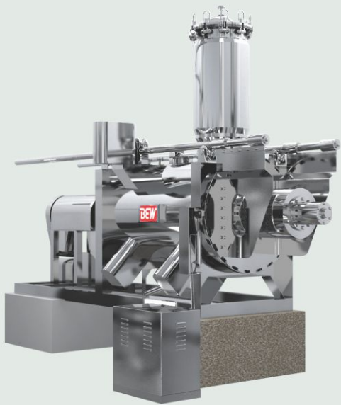
Plough Shear Mixer Dryer