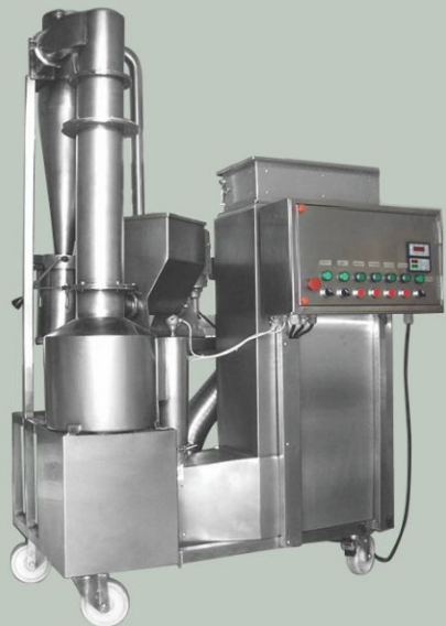
Spin Flash Dryer