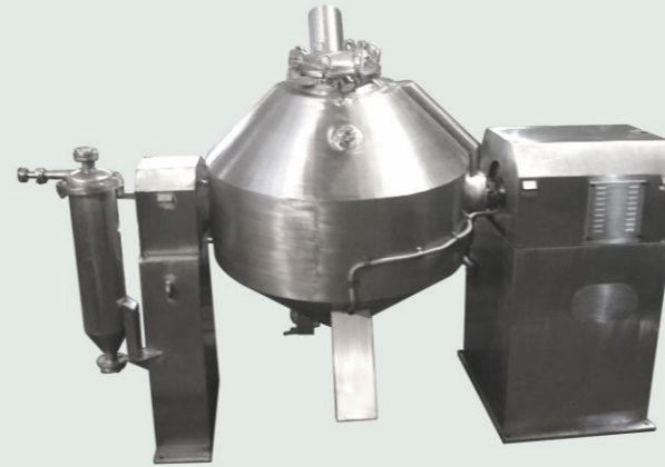
Rotocone Vacuum Dryer